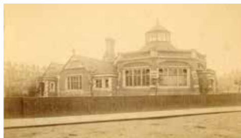
Minet Library, Knatchbull Rd, 1890.

south London novel; the action is set around Camberwell Green and the book was written while Gissing was living just a few doors down from the Minet Library on Burton Road.