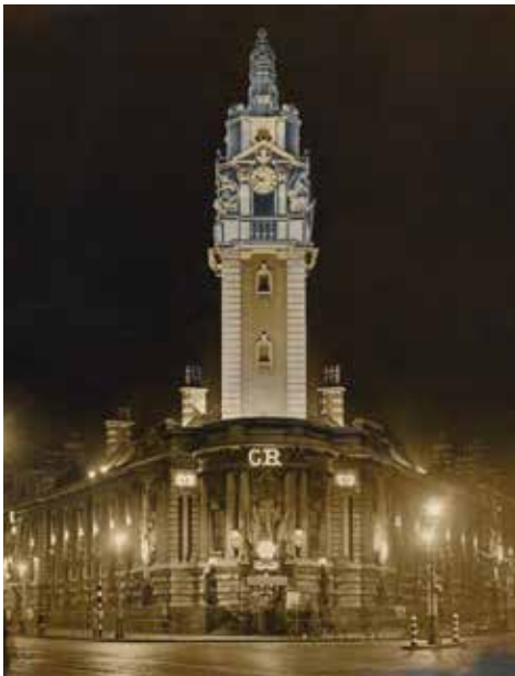
Lambeth Town hall, 1930s.

Pick up a brochure in your nearest library or download it from: www.londonopenhouse.org