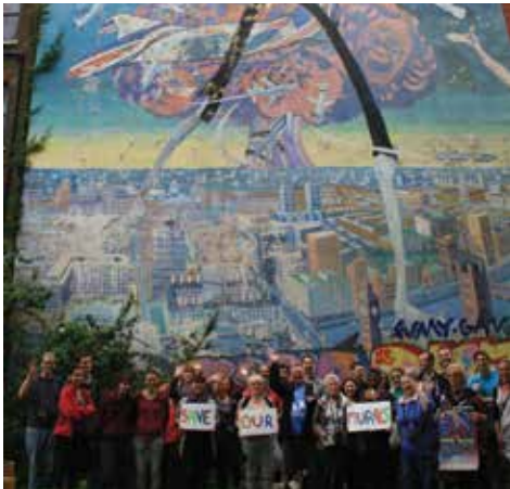
Still waving to save our murals, London Mural Preservation Society, 2012.