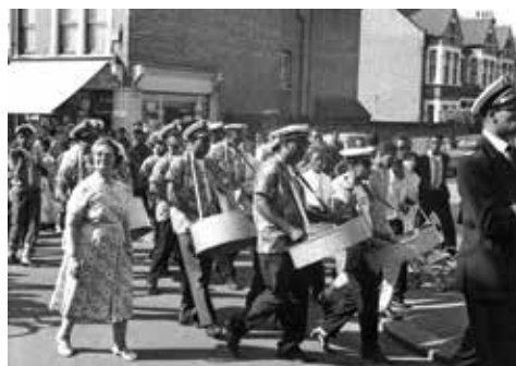
Steel band at Lambeth Festival, Rosendale Rd, 1961.