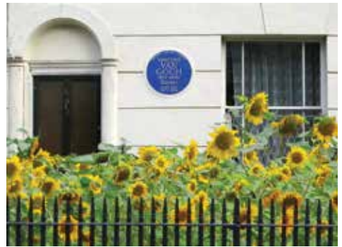
87 Hackford Rd, 2013

More information is available at: www.vangoghwalk.org