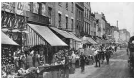
Cut Market, Waterloo, 1896.

pregnant or coal for the fire? The Fabian Women's Group's practical response to the poverty of the women of Lambeth gives vivid descriptions of the lives of working class people.