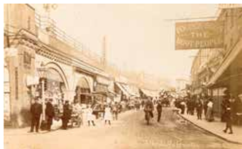
Brixton Market, Atlantic Rd, Brixton, c. 1910.

Organised by the Brixton Society, there will be two short illustrated talks with a local history display to view in the interval. Light refreshments will be provided.