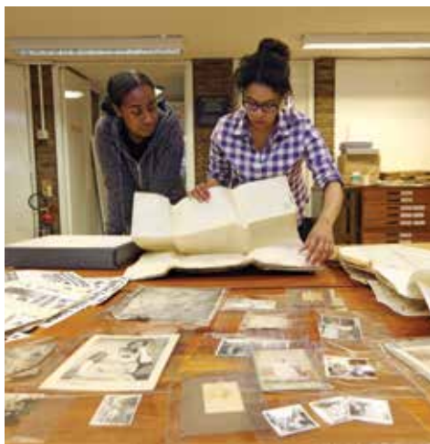
Black Cultural Archives.