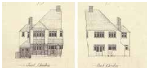
Plans of new houses on Brantwood Rd, Herne Hill, 1925.