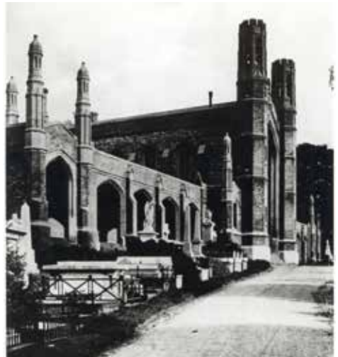
West Norwood Cemetery, c. 1890. The Church of England chapel and cloisters.

Booking is essential as places are limited, to reserve your place please e-mail: archives@lambeth.gov.uk or tel. 020 7926 6076.